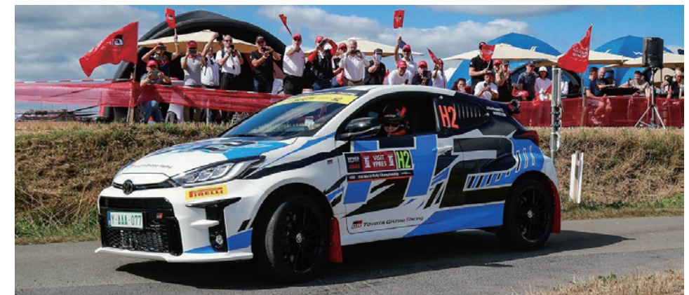
/ Energy Transition and Zero Carbon Technologies / Hydrogen