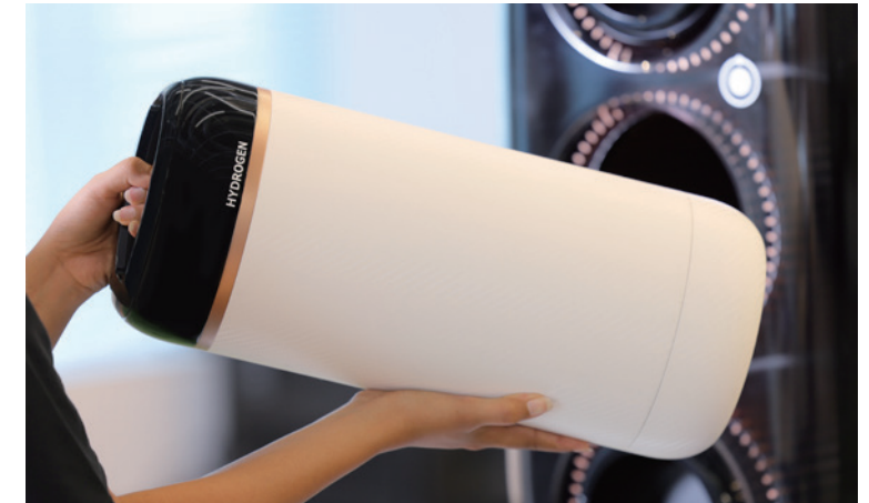
Portable Hydrogen Cartridge (Prototype)

Support by the government is essential for the spread of BEVs. Toyota will continue to ask the government to expand and accelerate the development of charging infrastructure (especially in rural areas where public transportation is insufficient, as well as in homes and apartment complexes), provide purchase support through subsidies and tax incentives, and promote public purchase by the government.