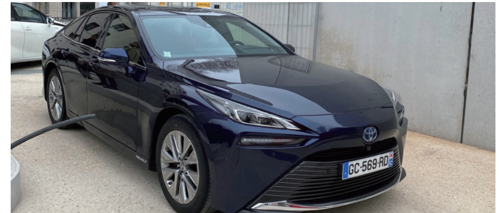
/ Energy Transition and Zero Carbon Technologies / Hydrogen