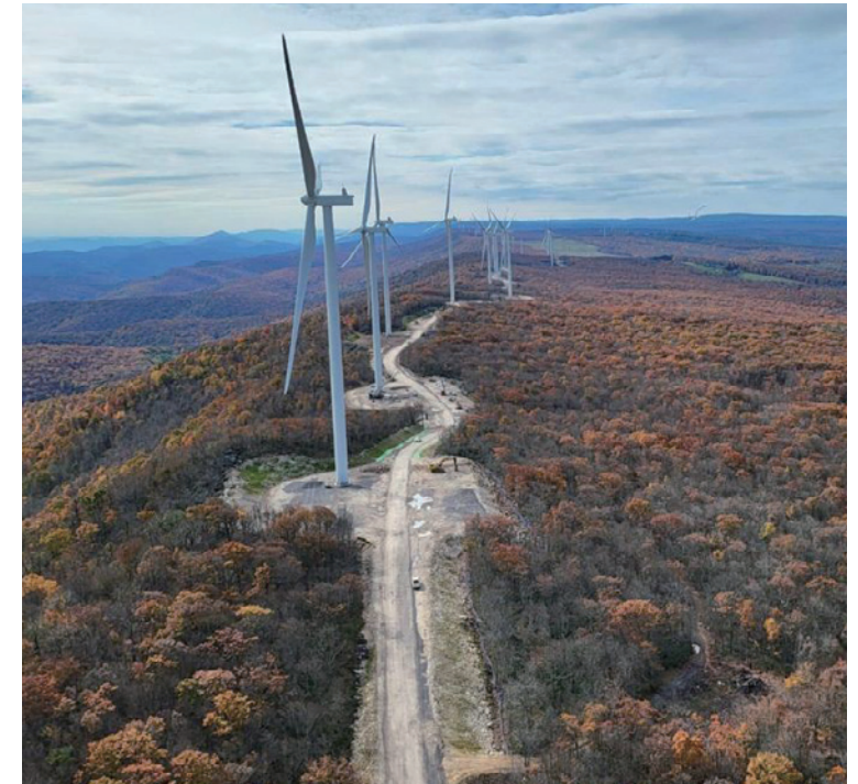
Black Rock Wind Farm Grant and Mineral Counties, WV