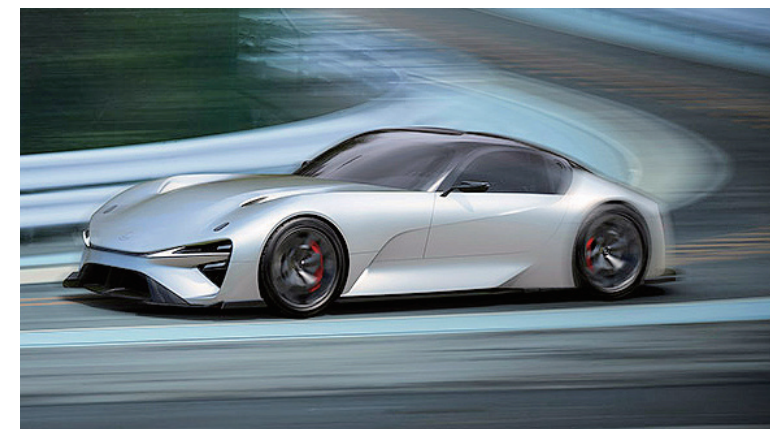
Lexus Electrified Sport