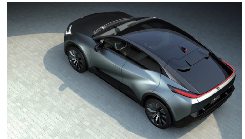
TOYOTA bZ Compact SUV Concept